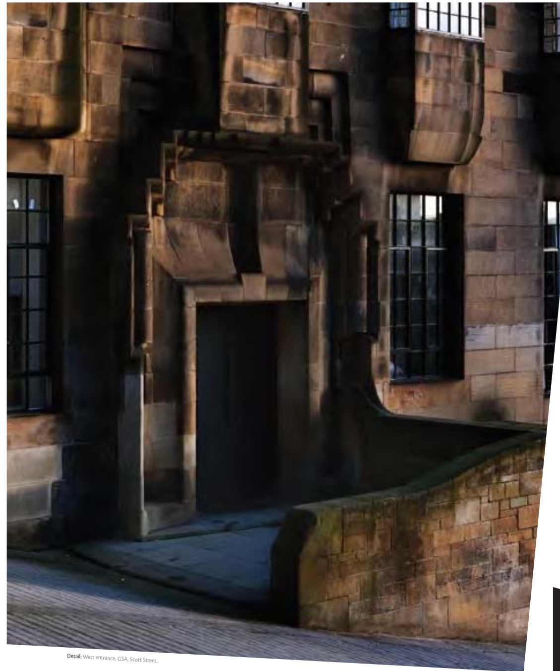
Detail: West entrance, GSA, Scott Street.

Please note that architectural constraints restrict wheelchair access to some buildings, and that some areas are inaccessible to those who are unable to manage stairs. We are happy to provide assistance where required.